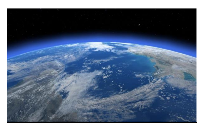
Fig. 4. A view of Earth from space. [4]

The use of outer space can be leveraged to advance the knowledge, technology, and insights needed to address significant weather events and climate change on Earth. Satellite observations enable continuous monitoring of global weather patterns – especially in areas without weather stations on the ground – and persistent tracking of key environmental issues such as methane leaks, coastal erosion, and ice melts. It is critical that the valuable data and innovations brought by space exploration and utilization not be overlooked in the fight against climate change. Leveraging "space for climate action" has been a focus of SGAPP and the