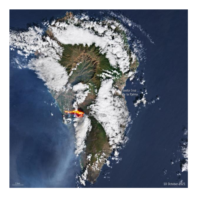
Fig. 2. La Palma volcanic eruption, as captured by Copernicus Sentinel-2 [32].

<sup>e</sup> An abridged perspective blog from a US Task Force member.